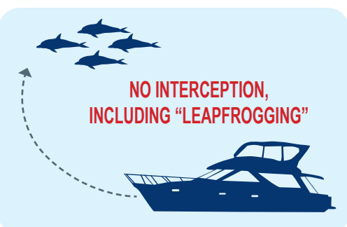
*Graphics not to scale