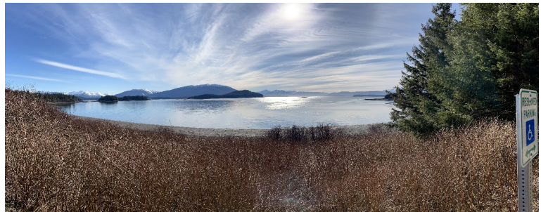
Map showing the experimental and control site along with photographs showing NOAA's RV Sashin used for mooring deployment and recovery, the theodolite observation tent, and the view of Auke Bay where data are being collected.