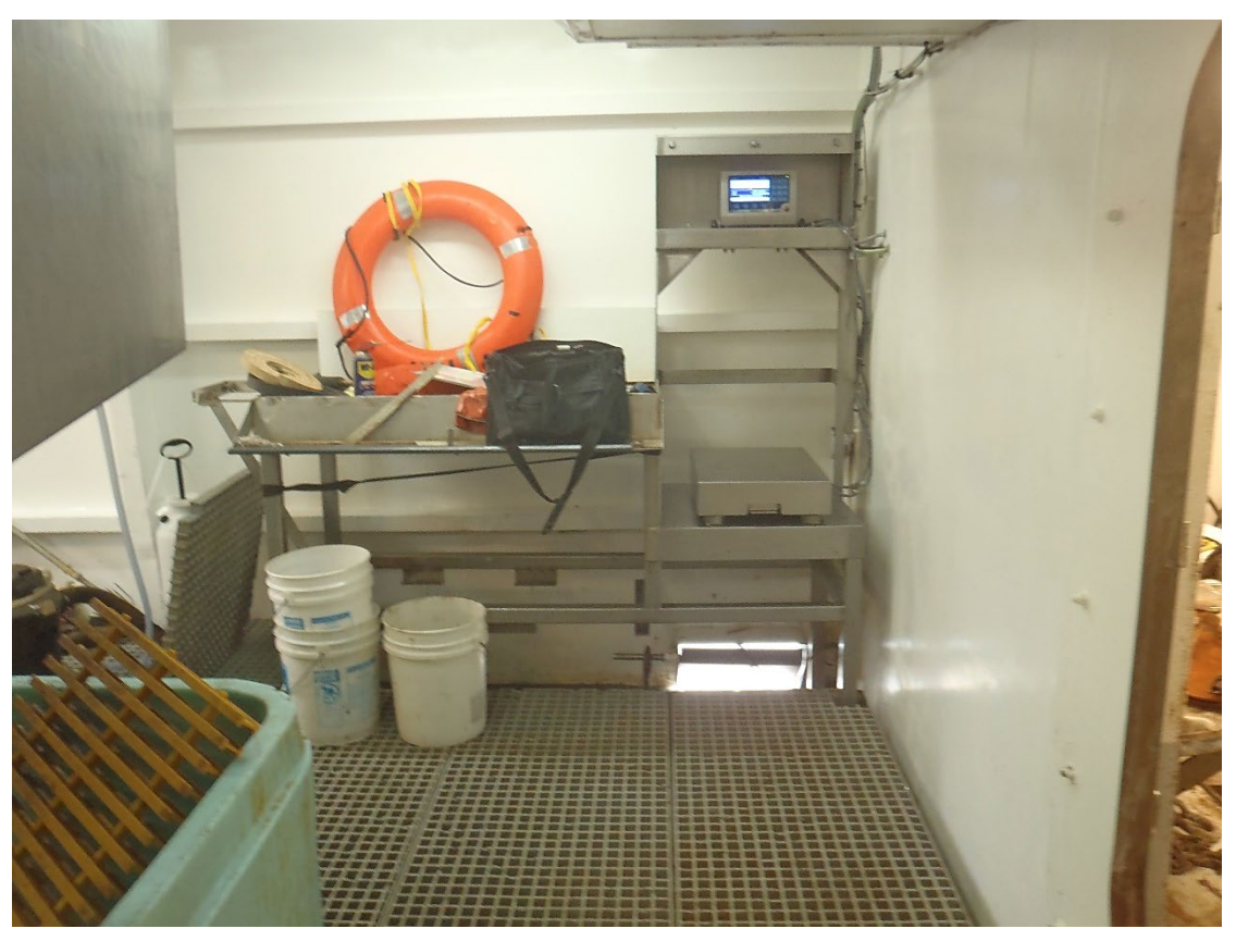
Figure 2-2 Observer sampling station with motion-compensated platform (MCP) scale.