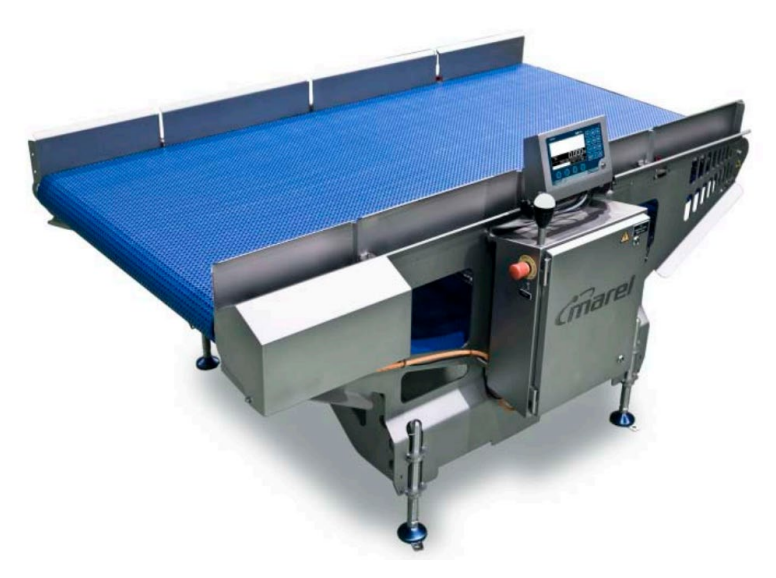
Figure 2-3 Flow scale. This image is for example purposes only and does not represent an endorsement by NMFS.