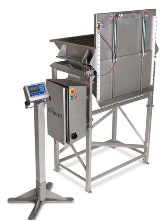
Figure 2-4 Hopper scale. This image is for example purposes only and does not represent an endorsement by NMFS.