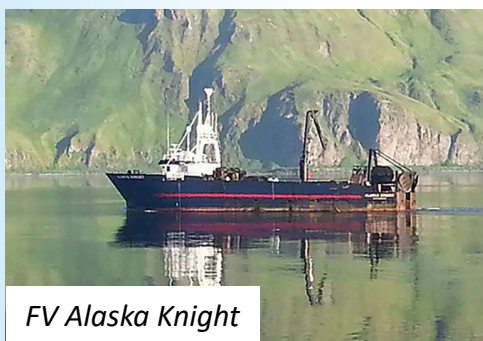
FV Alaska Knight

National Marine Fisheries Service 1315 East-West Highway SSMC 3, F/SF, Room 13362 Silver Spring, MD 20910