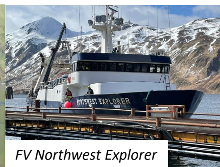
FV Northwest Explorer