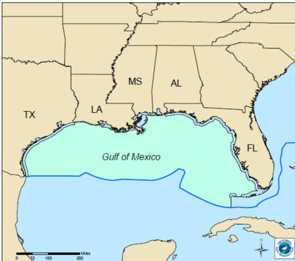
Figure 1.1.1. Jurisdictional boundary of the Gulf of Mexico Fishery Management Council.

Statement. Any events that change the fundamental nature of this proposed action will require a reevaluation of the categorical exclusion to determine its continued validity.