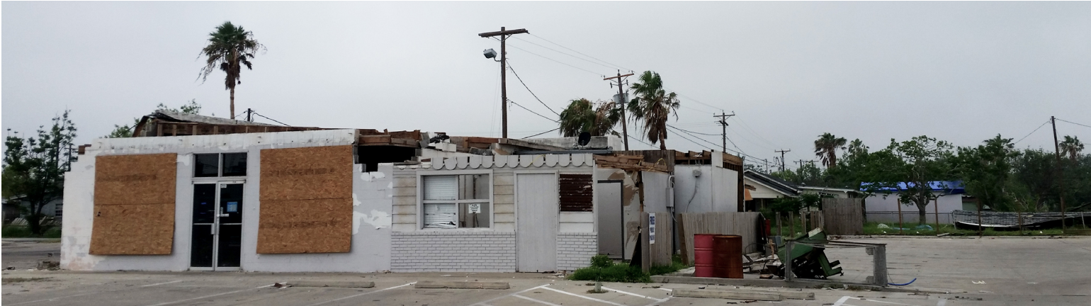
P J Shrimp Co in Fulton, Texas over 5 weeks after Hurricane Harvey.

The Texas commercial and seafood industry had revenues of $1 billion in 2016 and directly employed 16,000 workers . The commercial fishing fleet employed 3,400 fishermen .