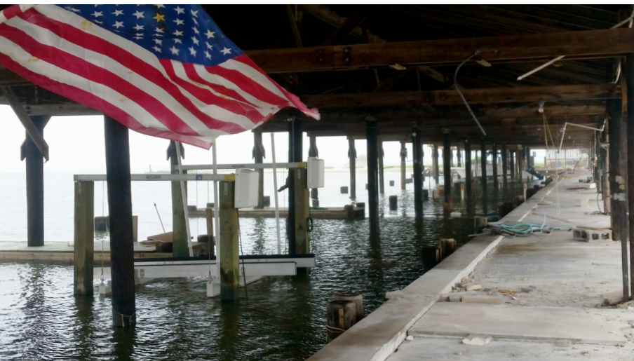
Damaged docks in Rockport, Texas over 5 weeks after Hurricane Harvey.

HURRICANE HARVEY made landfall near Rockport, Texas on August 25, 2017 as a Category 4 storm with damaging winds of 130 mph. Further, prolonged heavy rains associated with the storm resulted in extreme flooding events throughout Texas and into Louisiana. Texas Governor Greg Abbott estimated the damage from Hurricane Harvey at $150 billion to $180 billion for his state alone.