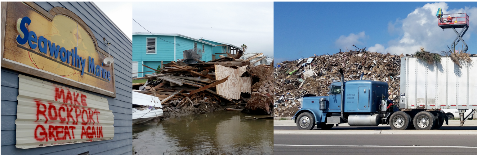
Over 5 weeks after Hurricane Harvey: A handmade sign on Seaworthy Marine Supply in Fulton, Texas (left); Debris in a residential area in Rockport, Texas (middle); A semi-trailer truck hauls away debris in Port Aransas, Texas.