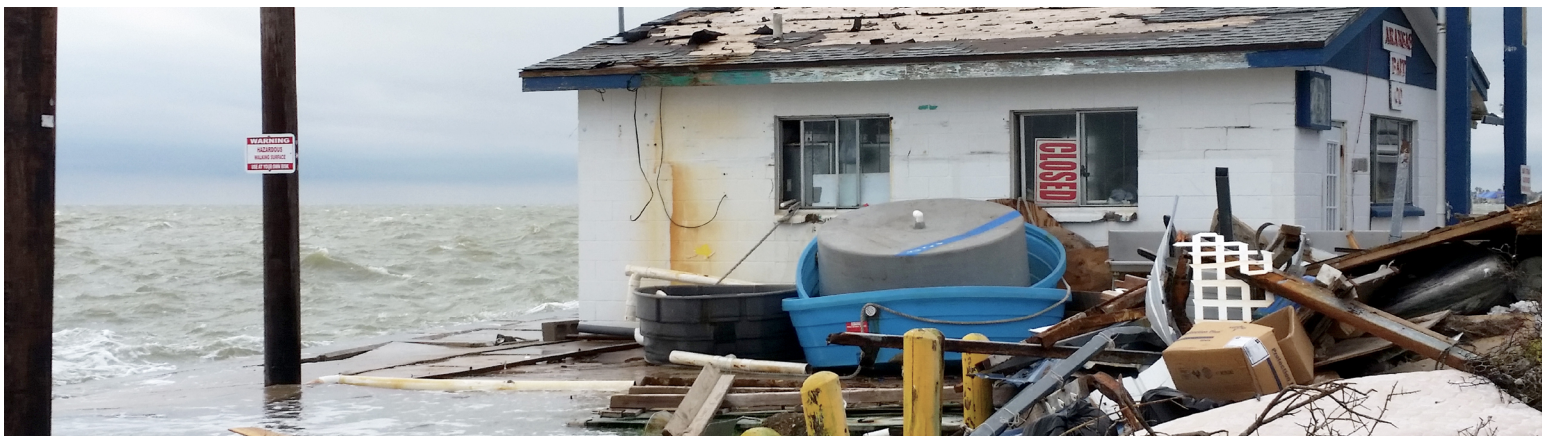
Aransas Bait Co in Fulton, Texas over 5 weeks after Hurricane Harvey.

Saltwater anglers spent $425 million on fishing trips in 2016, which directly supported 3,600 jobs . For hire operations alone directly employed 500 workers .