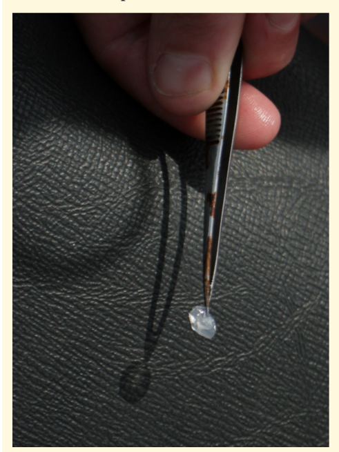
Scales collected after a prey event by a Southern Resident killer whales can be used to identify the species, age, and stock of the fish it came from.

Another study conducted by Dr. Dawn Noren used daily activity budgets to estimate the total energy expenditure and prey energy requirements of all individuals in the Southern Resident killer whale population. The results show that energy expenditure and prey consumption increases with age and body size. Not surprisingly, individual adult male killer whales require more food per day than adult females. However, since the Southern Resident killer whale population is comprised of many more adult females than adult males, this segment of the population, as a whole, consumes the majority of the total prey consumed by Southern Resident killer whales. Furthermore the number of fish consumed per killer whale varies with the size and species of the fish. For example, if Southern Resident killer whales only consume Chinook, which are large and energy-rich, they will consume fewer fish than if they only consumed chum, which are smaller and less energy-rich. These results provide one explanation of why Southern Resident killer whales seem to prefer Chinook over other salmon species.