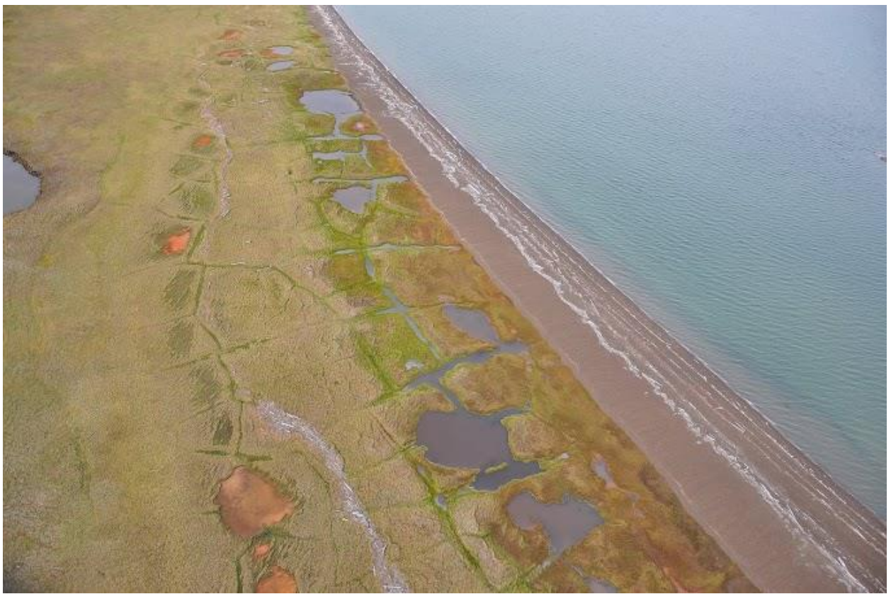
Figure 3. An oblique aerial photo of a section of shoreline showing (a) log lines associated with normal astronomical and meteorological tides on the beach (right) and (b) the highest storm-log line in the tundra (center frame). Two mappers estimated that the landward-most storm-log line is more than 50m landward of the normal high-water lines but less than 100 m (F3 Flooding Category).