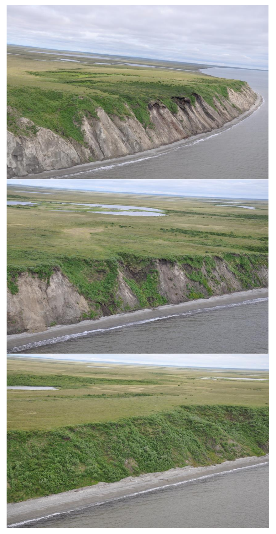
Figure 1a. Stability Class CE4 , an actively eroding, bare-faced cliff with <10% vegetation cover.

Figure 1 b. Stability Class CE3 , an actively eroding, partially vegetated cliff (10-90% vegetation cover)