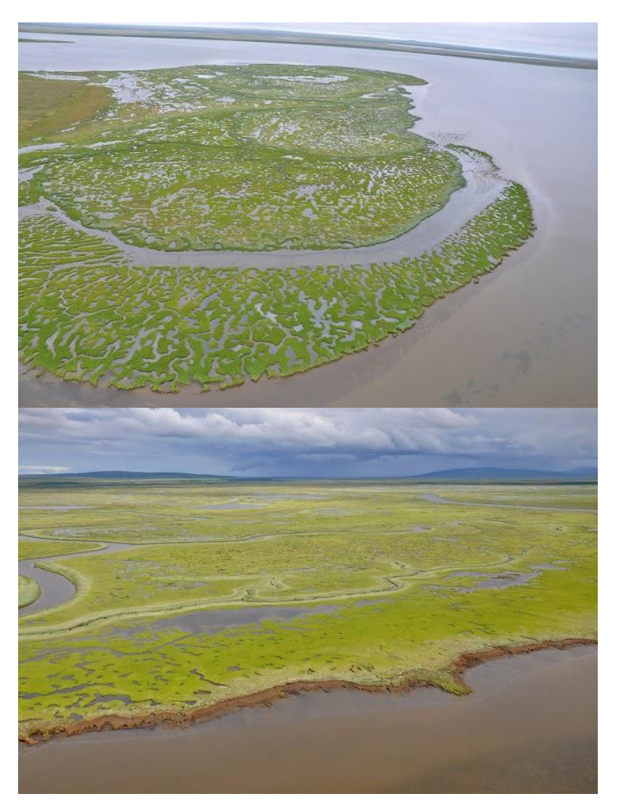
Figure 4a. A shoreline section with a moderate percentage of thaw lakes (estimated at 25-50% or Thaw Sensitivity Class T3).

Figure 4b. A shoreline section with a comparatively small percentage of thaw lakes in the backshore (estimated at 10-25% or a Thaw Sensitivity Class of T2)