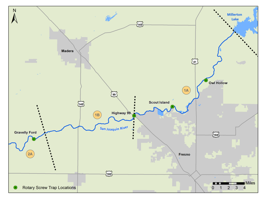
Figure A2. Map showing the RST monitoring locations (indicated by green circles) within Reaches 1 and 2 of the SJRRP Restoration Area. Figure produced by Reclamation.

Captured Chinook salmon were identified to lifestage, measured to length (fork length and total length, millimeters [mm]) and weighed (nearest 0.1 gram, and only for fish >45mm fork length), and a tissue sample collected for genetic analyses. After processing, fish were released approximately 20–30 meters downstream from the RST. In the event that capture at any one RST location exceeded 60 Chinook salmon within a single period, only the first 60 were processed in the aforementioned manner, and the remainder enumerated—this only happened on three occasions during December at the Owl Hollow RST. A total of 1,578 salmon were captured in RSTs during the 2021–22 sampling season; however, based on length-at-date regressions, developed from genetic analyses of fish captured during three seasons of RST efforts from 2017–2020, 138 of these fish were not considered spring-run Chinook salmon. During past RST seasons, fish outside the predication band were often determined to be juvenile fall-run Chinook salmon, likely released after hatching from eggs from the Classroom Aquarium Education Program (https://wildlife.ca.gov/CAEP). Verification of run-type and parentage will be assessed through genetic analyses. Once genetic results are available from the fin clips, these numbers may be adjusted accordingly. Table A3 summarizes the RST catches by location and lifestage.