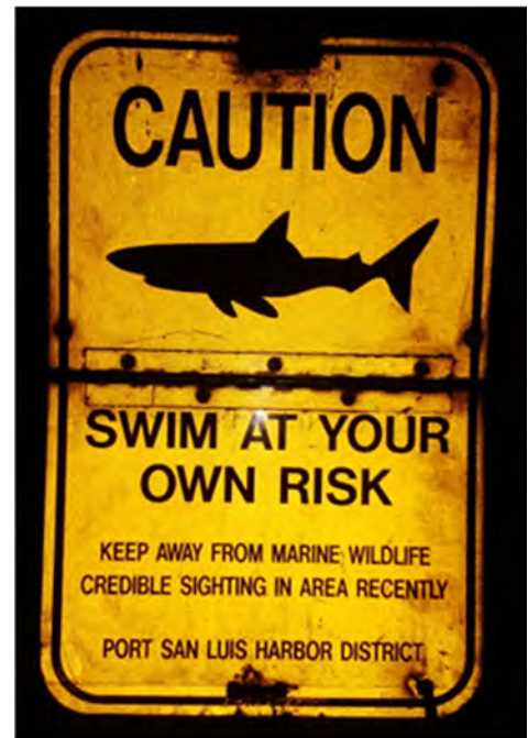
Shark posting at Port San Luis

Three of the sick animals (potentially only two as one may have been the same animal viewed the next day) appeared to seek out proximity to the work vessels, staying close to the barge for an extended period. One of these eventually swam into an open tire bumper where it expired without any physical trauma or harassment actions.