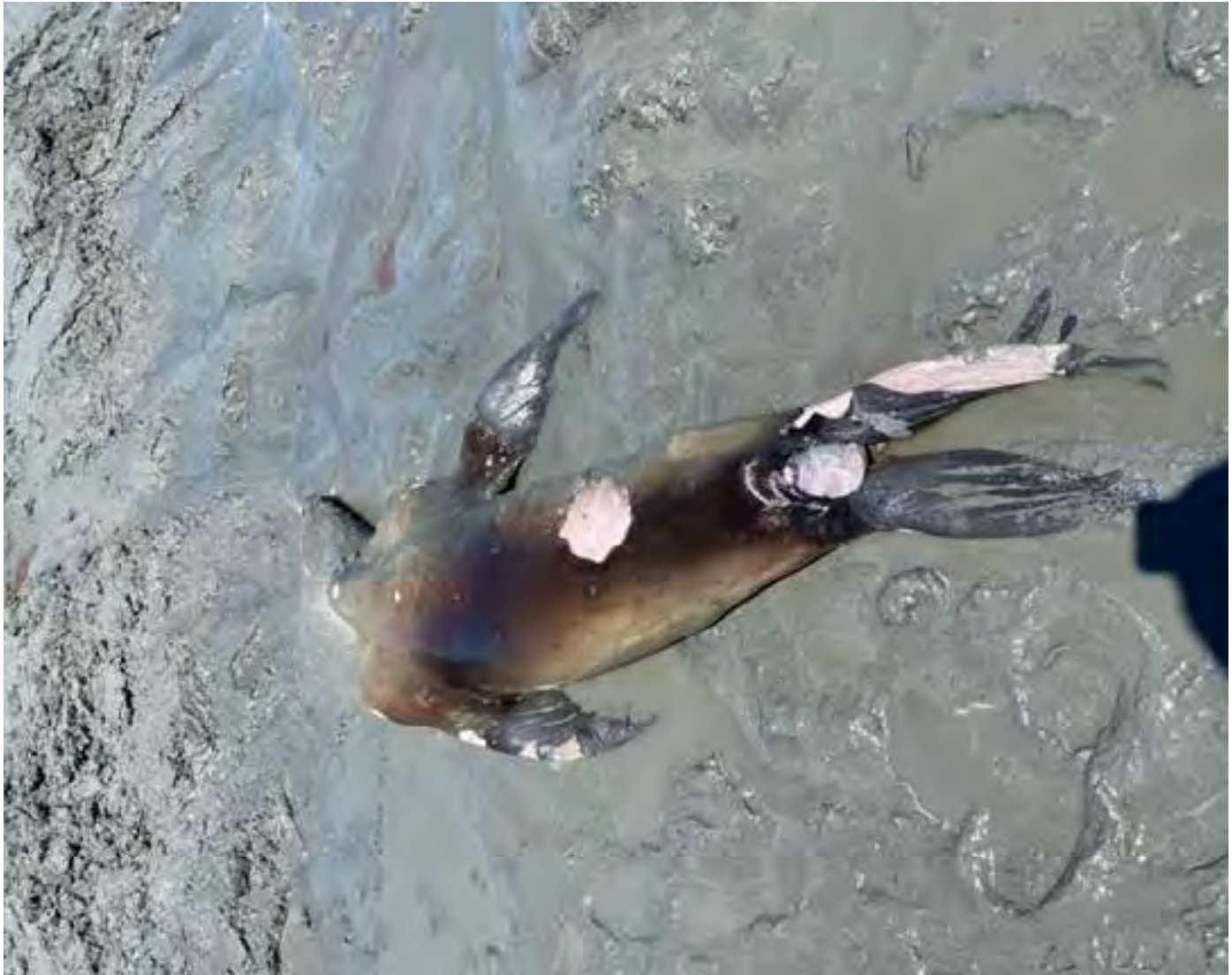
VENTRAL SIDE OF RINSED ANIMAL