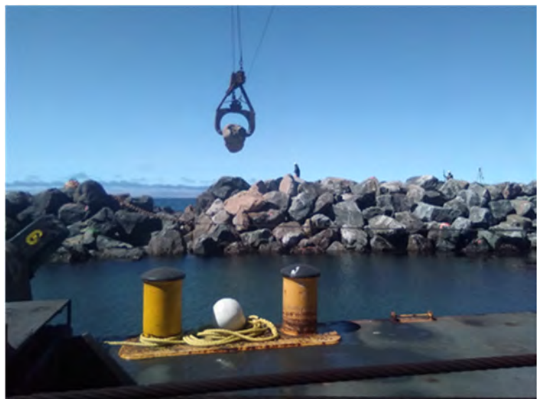
View of placement area from Starboard Stern of the DB Long Beach

The PSO was positioned on the Derrick Barge Long Beach (DBLB) from which work was conducted. The DBLB has a length of 255 feet and a beam of 76 feet. The barge sits approximately 8 feet above the water. The PSO moved freely around the vessel allowing observations to be made from multiple locations, including some elevated positions. For purposes of monitoring, there were eight positions from which observations were made and reported. These included eight defined locations: port stern (PS), stern (S), starboard stern (SS), mid-starboard (MS), starboard bow (SB), bow (B), port bow (PB), and mid-port (MP).