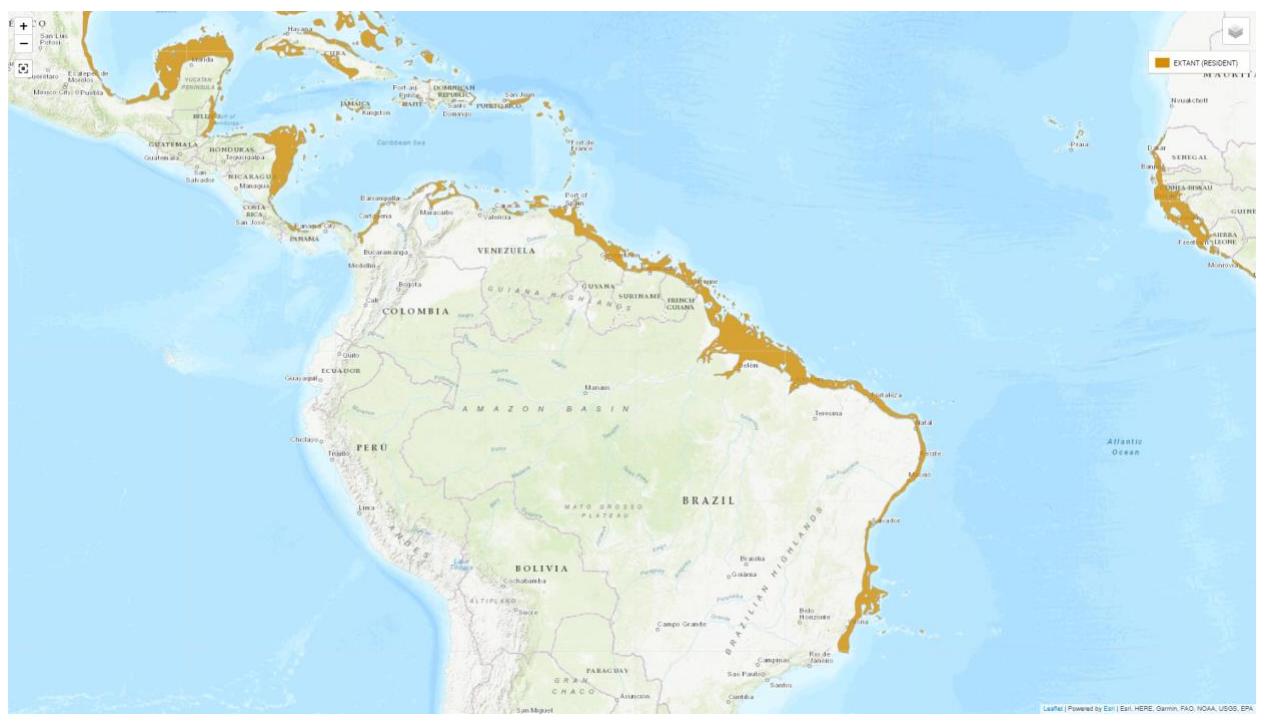
Map (Dulvy et al. 2021, at 4).