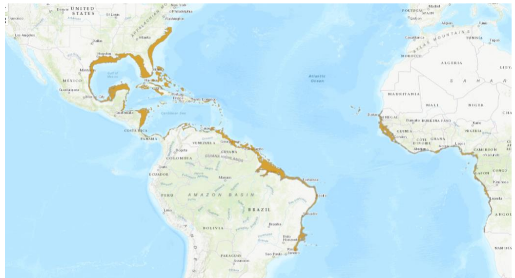
Map (Dulvy et al. 2021, at 4).