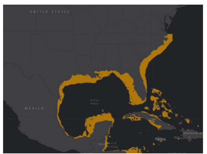
United States Territory (Dulvy et al. 2021, at 4).