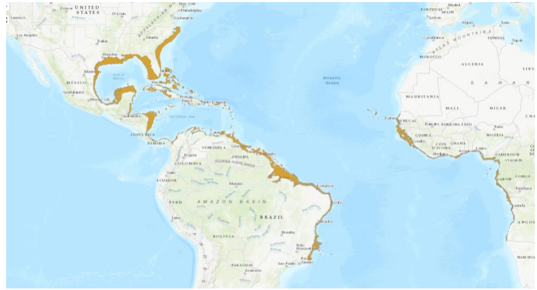
Map (Dulvy et al. 2021, at 4).