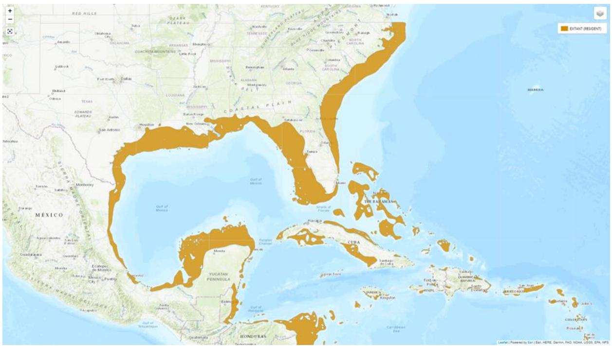
Map (Dulvy et al. 2021, at 4).

take U.S. eagle rays to countries where the species is declining ( Id. ). A study off the Florida coast, for example, indicated an "overall decrease in the numbers of spotted eagle rays observed on a yearly basis in both ... aerial and boat-based surveys from 2008 to 2013" (Bassos-Hull et al. 2014, at 1051). Additionally, "small-scale, directed fisheries in the southern Gulf of Mexico and northeastern Venezuela that capture juvenile, mature, and pregnant individuals are a concern for the viability" of the whitespotted eagle ray population (Tagliafico et al. 2012, at 315). The international migrations of the Florida-based whitespotted eagle ray population exposes these individuals to substantial threats and contributes to the endangerment of the species.