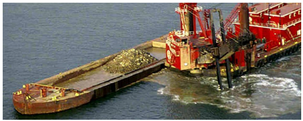
Source: What is Dredging?, NAT'L OCEANIC & ATMOSPHERIC ADMIN. (NOAA)

Noise impacts from dredging may also harm whitespotted eagle rays. Generally, dredging produces continuous sound frequencies below 1kHz, however this low level is likely to increase when the dredging includes the breaking and or removal of rocks, leading to higher levels of noise pollution ( Id. at 979). This noise pollution is known to negatively impact whitespotted eagle rays (Berthe & Lecchini, at 100–102).