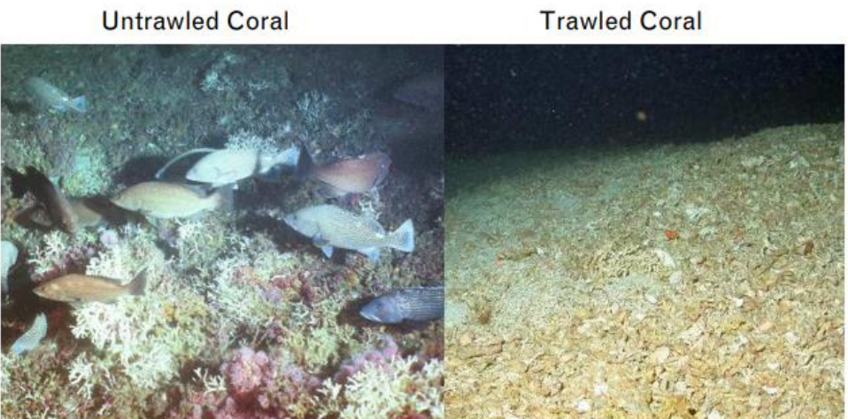
Florida's Oculina Banks.

Trawling also disturbs the bottom sediment and geochemical cycling, causing the water to become murky, thereby diminishing photosynthesis in shallow waters and making it more difficult for those species that use sight to hunt for food and cause filter-feeding animals to consume particles with no nutritional value, such as sand (Id.). Toxins can also become "exposed and circulated," leading to their further dispersal throughout the ocean habitats (Id.). A field study in a Norweign fjord found that a 1.8 km long trawl pass created a "3-5 million m<sup>3</sup> sediment plume[,] containing around 9 t of contaminated sediment," equivalent to "c. 10% of the annual gross sedimentation rate" and resulted in "[polychlorinated dibenzo-p-dioxins and furans] from the sediments [to be] taken up by mussels which, during one month, accumulated them to levels above the EU maximum advised concentration for human consumption" (Bradshaw et al. 2012, at 232). Food availability or quality for bottom-feeders can also diminish through the redistribution of high-quality food particles and nutrients and the consequential shift in regional nutrient cycling as a result of trawling (Trawling Takes a Toll, American Museum of Natural History). Thus, trawling is "among the most serious" threats to the ocean (Id.). It degrades and destroys critical whitespotted eagle ray habitat and reduces foraging opportunities for the species.