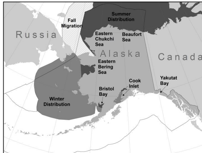
Figure 1. Approximate distribution for all five beluga whale stocks. The Beaufort Sea, Eastern Chukchi Sea, Eastern Bering Sea, and Bristol Bay beluga whale stocks summer in the Beaufort Sea (Beaufort Sea and Eastern Chukchi Sea stocks) and Bering Sea (Eastern Bering Sea and Bristol Bay stocks); they overwinter in the Bering Sea. The Bristol Bay and Cook Inlet beluga whale stocks show only small seasonal shifts in distribution, remaining in Bristol Bay and Cook Inlet, respectively, throughout the year. Summering areas are dark gray, wintering areas are lighter gray, and the hashed area is a region used by the Eastern Chukchi Sea and Beaufort Sea stocks for autumn migration. The U.S. Exclusive Economic Zone is delineated by a black line.

The Beaufort Sea and Eastern Chukchi Sea stocks of beluga whales migrate between the Bering and Beaufort seas. Beaufort Sea beluga whales depart the Bering Sea in early spring, migrate through the Chukchi Sea and into the Canadian waters of the eastern Beaufort Sea where they remain in the summer and fall, returning to the Bering Sea in late fall. Eastern Chukchi Sea beluga whales depart the Bering Sea in late spring and early summer, migrate through the Chukchi Sea and into the western Beaufort Sea where they remain in the summer, returning to the Bering Sea in the fall. The Eastern Bering Sea beluga whale stock remains in the Bering Sea but migrates south near Bristol Bay in winter and returns north to Norton Sound and the mouth of the Yukon River in summer (Suydam 2009, Hauser et al. 2014, Citta et al. 2017, Lowry et al. 2019). Beluga whales tagged in Bristol Bay (Quakenbush 2003; Citta et al. 2016, 2017) and Cook Inlet (Goetz et al. 2012a; Sheldon et al. 2015, 2018; Lowry et al. 2019) remained in those areas throughout the year, showing only small seasonal shifts in distribution.