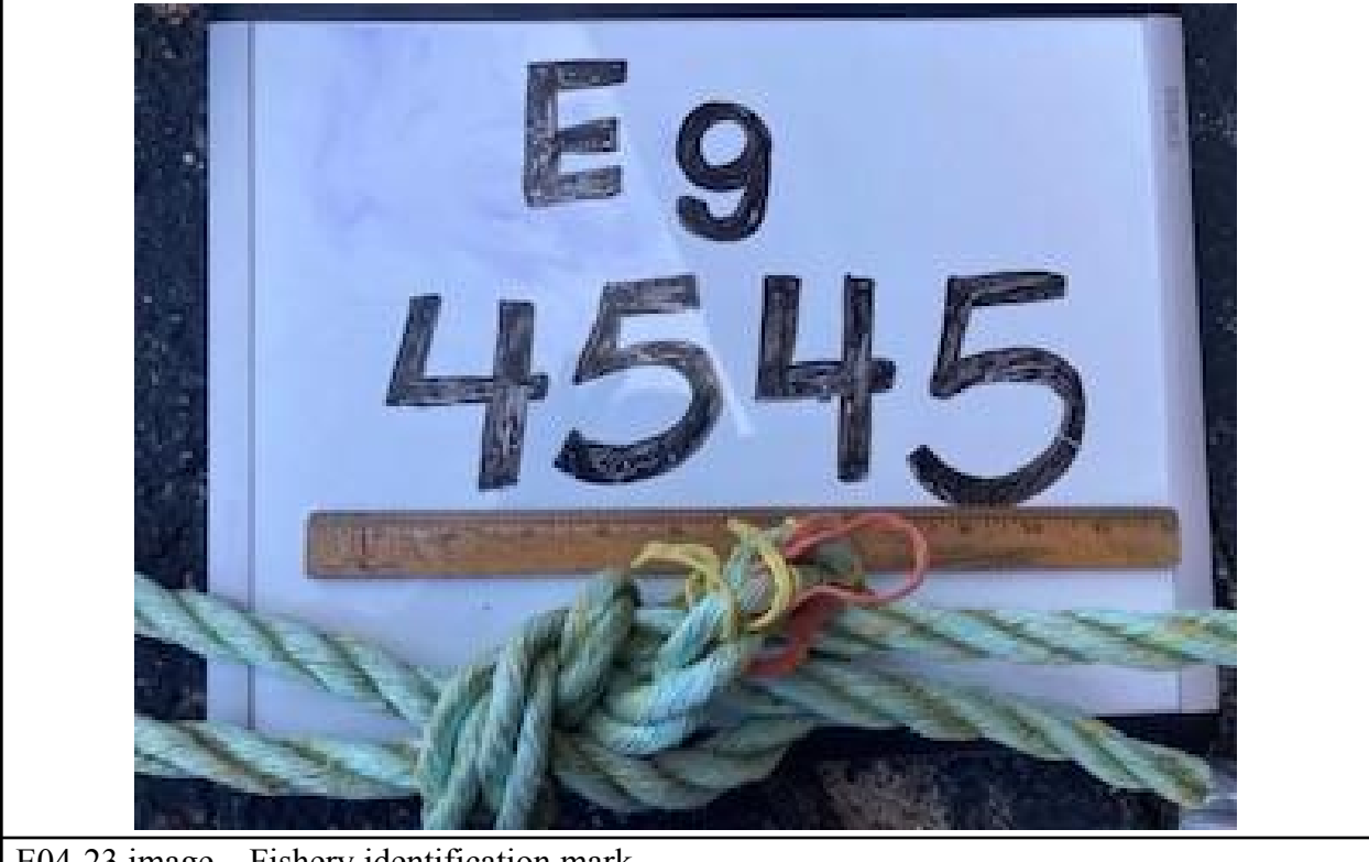
E04-23 image – Fishery identification mark.