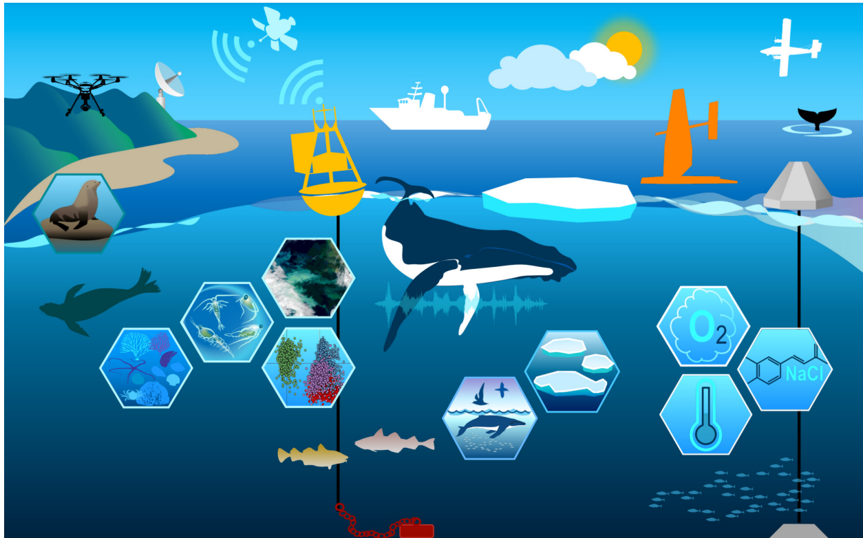
Figure 3. Schematic of current and proposed technology deployment for the eastern Bering Sea.