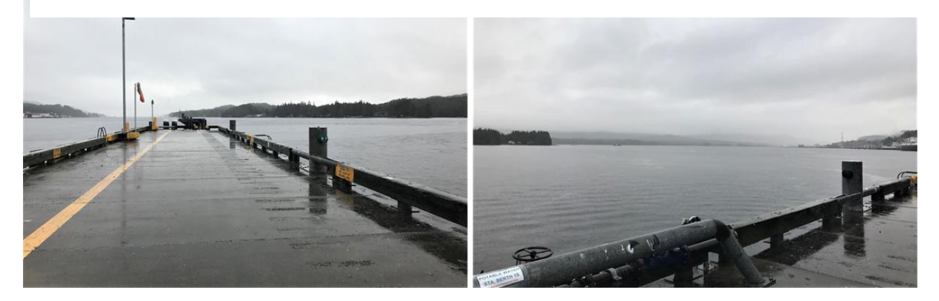
Figure 3. View from "South Dock" PSO observing location on Berth IV of the Ketchikan cruise ship dock: left) view to the southeast, right) view of the blasting area, northwest.