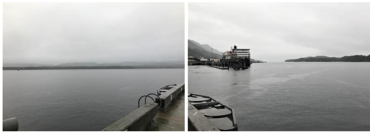
Figure 2. View from "North Dock" PSO observing location on Berth I of the Ketchikan cruise ship dock: left) view to the southwest, right) view of the blasting area, north.