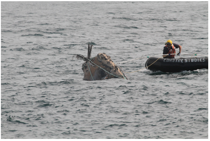
Photo (above): Broken baleen protrudes from the mouth of entangled and injured male right whale #3125 as responders from the Center for Coastal Studies attempt to remove rope constricting the whale's head and mouth.

The UME Program was established by Congress under the MMPA to investigate die-offs of marine mammals. The Working Group on Marine Mammal UMEs is composed of marine mammal health experts who determine when a morbidity or mortality event is "unusual." NOAA Fisheries reviews the Working Group's recommendation and decides whether to declare a UME for species under our jurisdiction (whales, dolphins, seals, and sea lions).