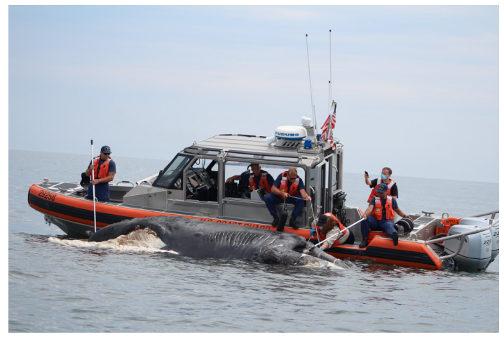
Photo (above): The U.S. Coast Guard helped NOAA and partners respond to a dead vessel-struck North Atlantic right whale calf off New Jersey in 2020 (calf of right whale #3560). The carcass was towed ashore for a full necropsy to confirm and document the injuries.

Photo (right): Close-up of "Dragon" (#3180), an entangled adult female with a buoy and rope in her mouth in 2020.