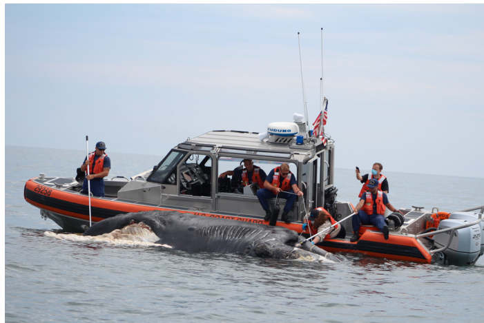
Photo (above): The U.S. Coast Guard helped NOAA and partners respond to a dead vessel-struck North Atlantic right whale calf off New Jersey in 2020 (calf of right whale #3560). The carcass was towed ashore for a full necropsy to confirm and document the injuries.