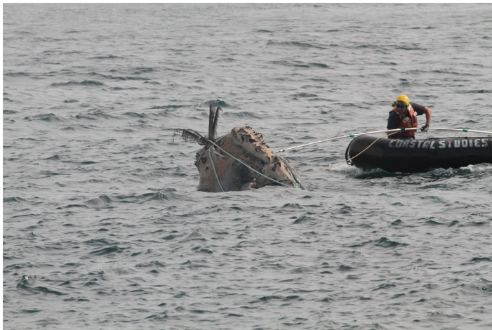
Photo (above): Broken baleen protrudes from the mouth of entangled and injured male right whale #3125 as responders from the Center for Coastal Studies attempt to remove rope constricting the whale’s head and mouth.

The UME Program was established by Congress under the MMPA to investigate die-offs of marine mammals. The Working Group on Marine Mammal UMEs is composed of marine mammal health experts who determine when a morbidity or mortality event is “unusual.” NOAA Fisheries reviews the Working Group’s recommendation and decides whether to declare a UME for species under our jurisdiction (whales, dolphins, seals, and sea lions).