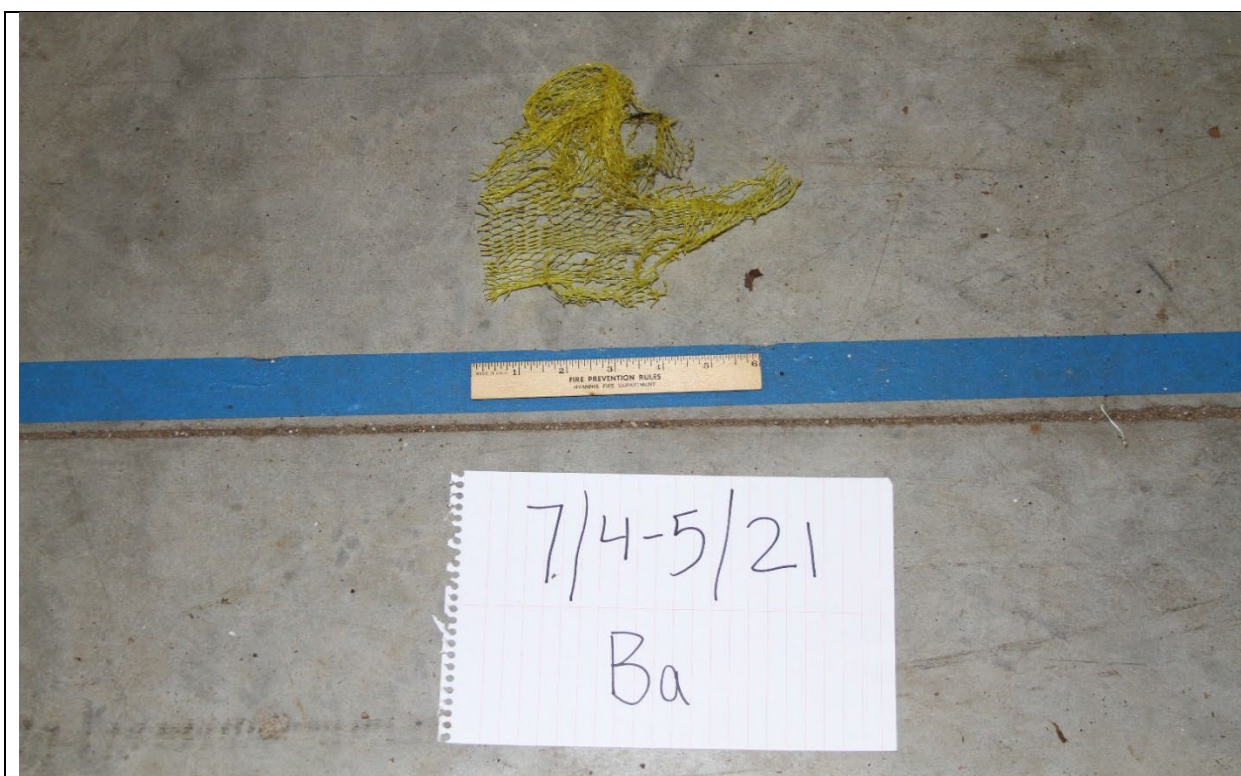
E11-21 – portion of recovered mesh bag