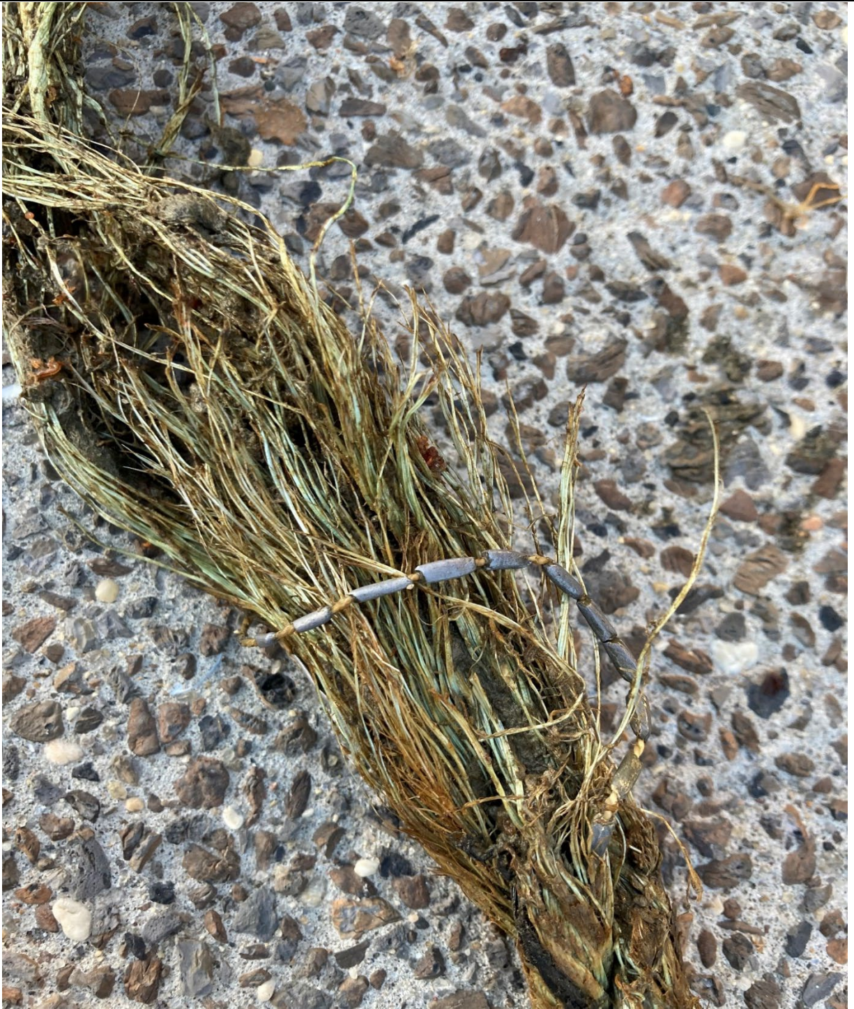
E04-21 image – Sink line showing the beaded lead yarn.