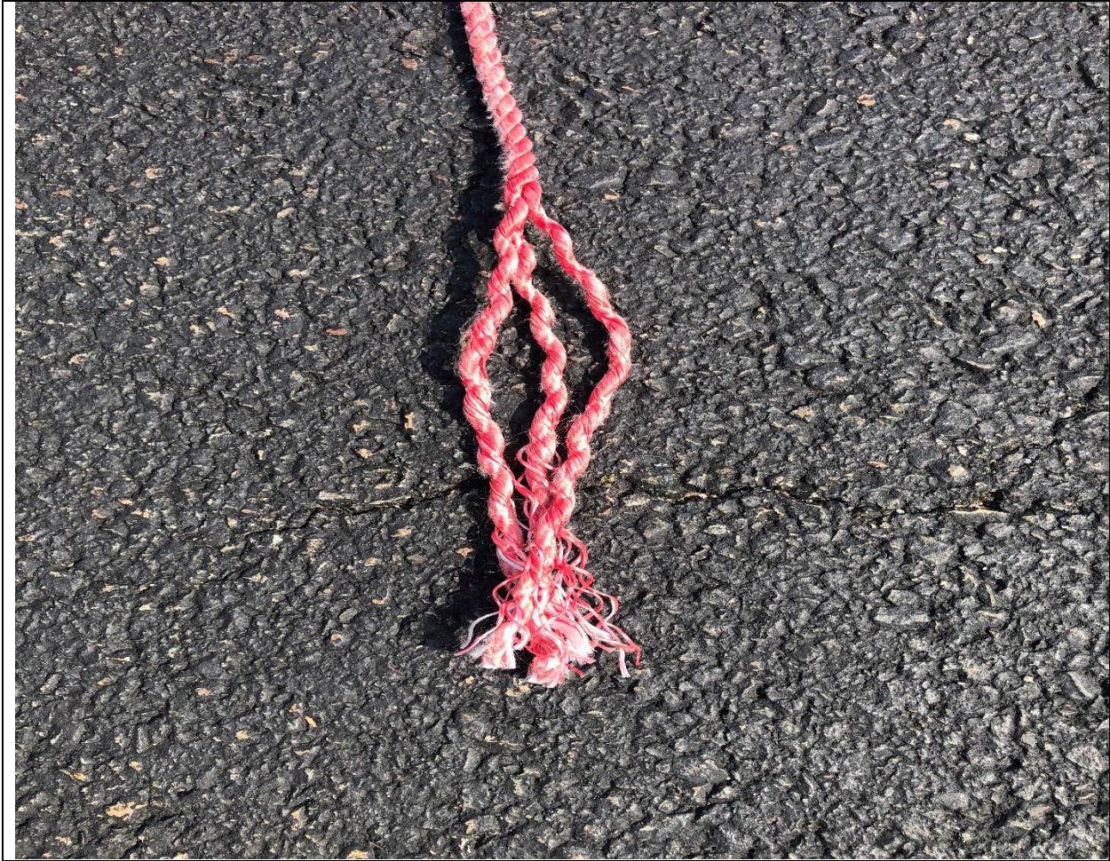
E22-21 – Close up of parted Rocky Mount weak rope.