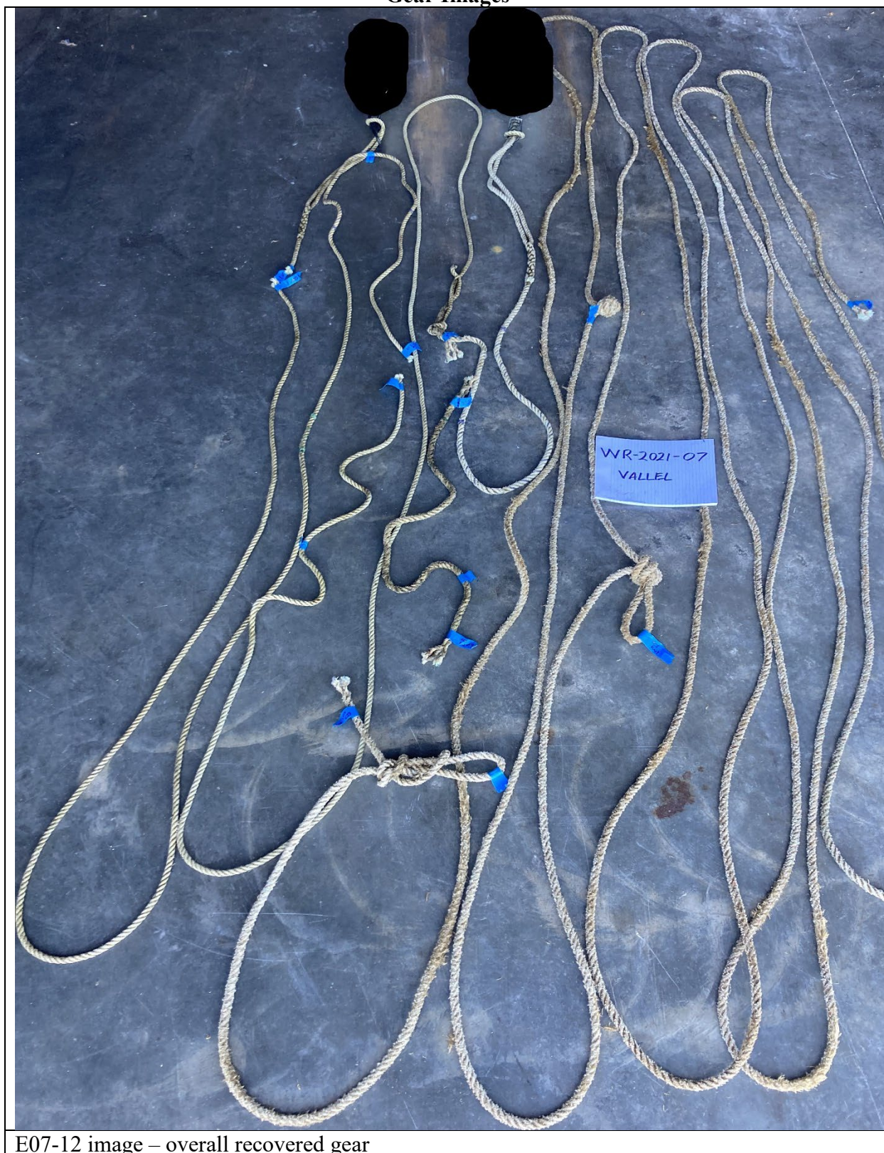
E07-12 image – overall recovered gear