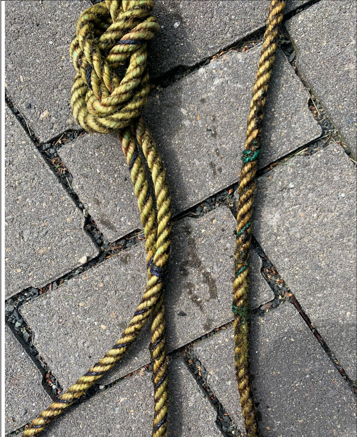
E07-12 image – woven purple and green twine in the endline