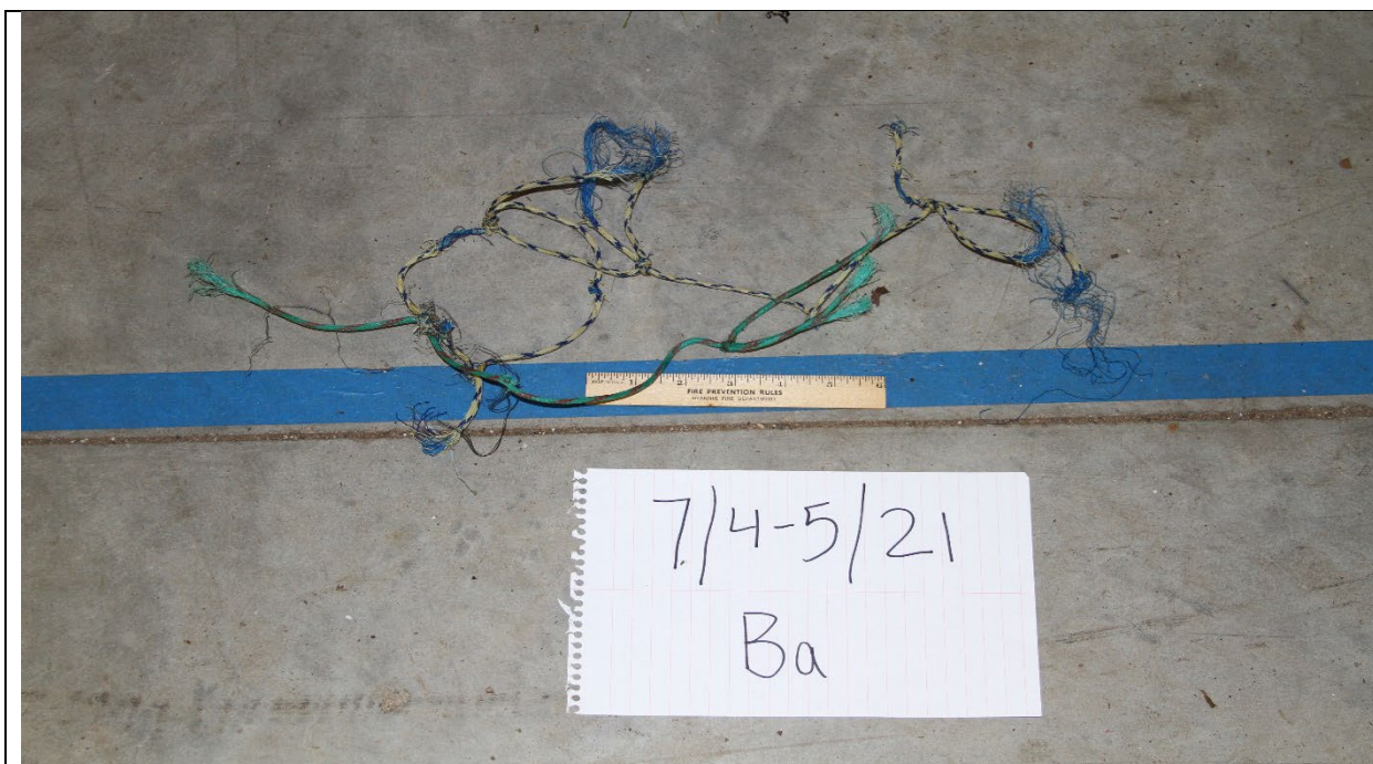
E11-21 – portion of recovered line and mesh