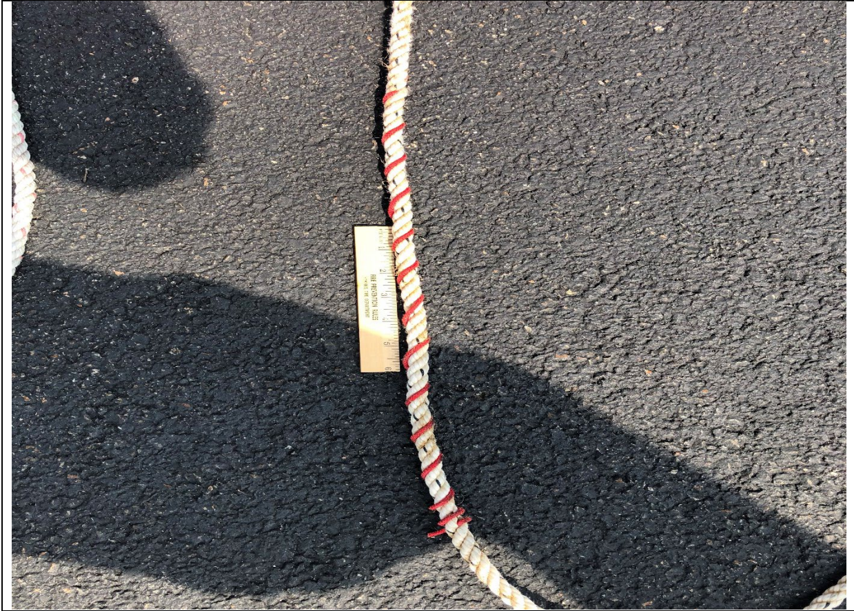
E22-21 – ALWTRP red Massachusetts mark