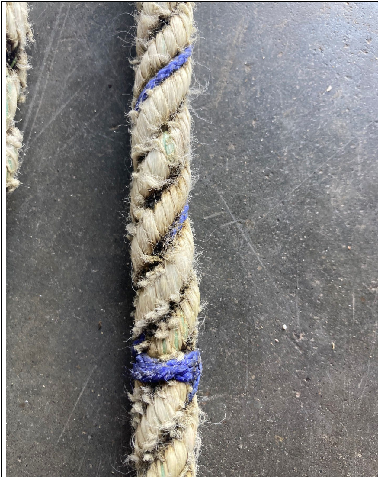
E07-12 image – close up of recovered woven purple twine in the endline