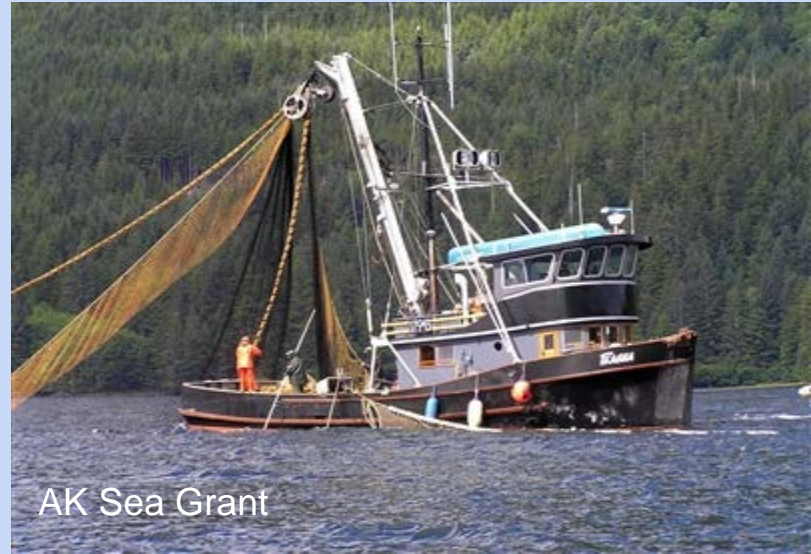
AK Sea Grant