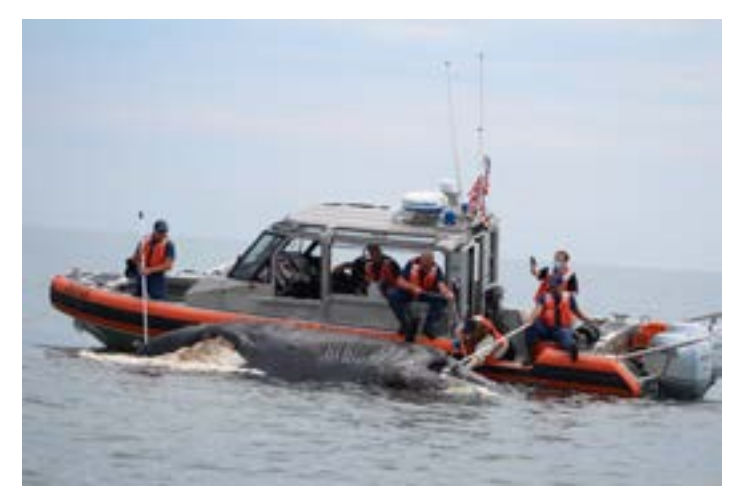
Photo (above): The U.S. Coast Guard helped NOAA and partners respond to a dead vessel-struck North Atlantic right whale calf off New Jersey in 2020 (calf of right whale #3560). The carcass was towed ashore for a full necropsy to confirm and document the injuries.

Photo (right): Close-up of "Dragon" (#3180), an entangled adult female with a buoy and rope in her mouth in 2020.