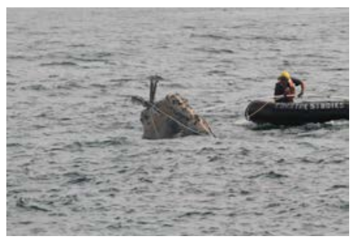
Photo (above): Broken baleen protrudes from the mouth of entangled and injured male right whale #3125 as responders from the Center for Coastal Studies attempt to remove rope constricting the whale's head and mouth.

The UME Program was established by Congress under the MMPA to investigate die-offs of marine mammals. The Working Group on Marine Mammal UMEs is composed of marine mammal health experts who determine when a morbidity or mortality event is "unusual." NOAA Fisheries reviews the Working Group's recommendation and decides whether to declare a UME for species under our jurisdiction (whales, dolphins, seals, and sea lions).