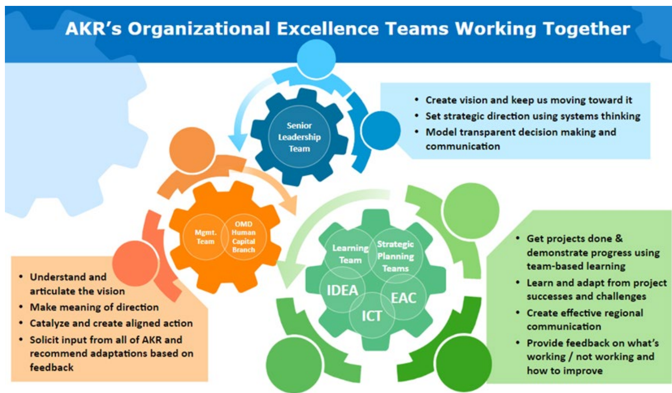
Figure 5. AKR's cross-divisional teams that work together to achieve organizational excellence.

enables us to foster cross-divisional working relationships to implement actions for the benefit of the entire organization to achieve our mission. The experience of working together in an inclusive and transparent way is foundational to how we do our work. We want to cultivate an environment in which all employees thrive and work together across the organization to achieve our mission and help achieve the objectives identified in our Strategic Plan.