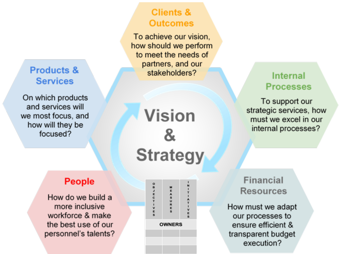
Figure 4. The AKR scorecard tracks objective measures and initiative along the five perspectives.