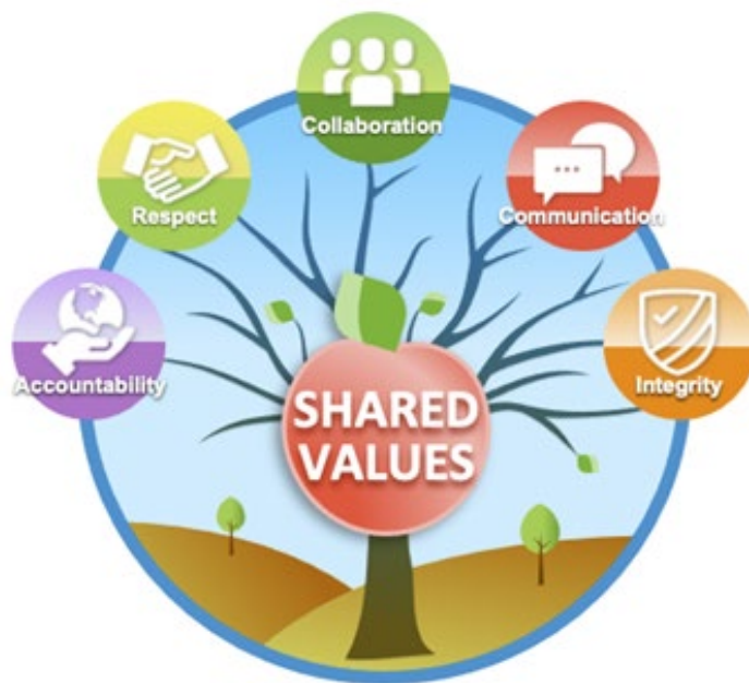
Figure 1. Our shared values are essential and enduring principles that are embedded in the culture of our organization. They are guiding principles for all the work we do as an organization and how we interact and work together.

Our continued success as an organization is challenged by the need to be more adaptable, illustrated by the impacts of climate change, changes in our workforce, shifts in budget priorities, and the evolving needs of our stakeholders. The broad purpose of our Strategic Plan is to envision our future as an organization and identify steps to realize that future that are intentional and proactive . This plan serves as an aid to help AKR leadership make decisions on where and when to place resources to improve our ability to achieve our desired outcomes.