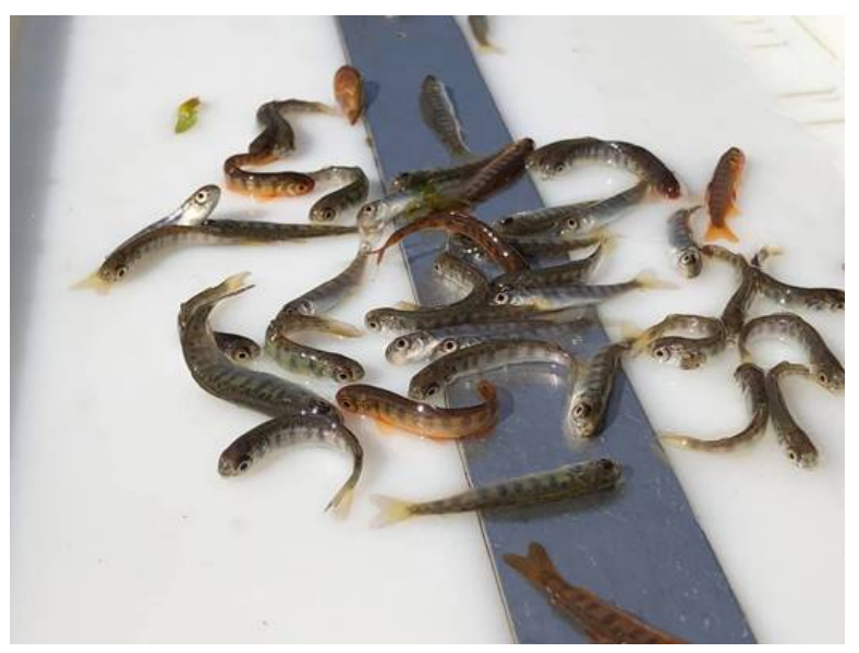
LAD fall-run Chinook salmon next to BBY stained fall-run Chinook salmon recaptures (orange) from the 2nd mark-recapture trial (photo taken 2/14/2020, the day after the fish were released).

Fall-run Chinook salmon were stained for a mark recapture trial on the island near the Watt Avenue RST. Fish were released approximately 0.5 miles upstream of the traps across the width of the river. See photo below of stained and LAD fall-run Chinook salmon.