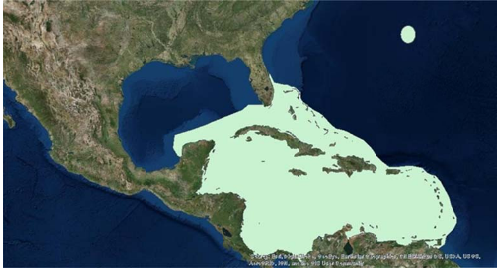
Figure 1. Range of Nassau grouper (Epinephelus striatus).

Nassau grouper occur in Bermuda and Florida, throughout the Bahamas and the Caribbean Sea (Figure 1). Their distribution within Florida is from Cape Canaveral south through the Florida Keys and Florida Bay westward to the Dry Tortugas and Pulley Ridge. They are fairly uncommon in Florida, with mixed accounts of historical abundance, and are considered rare in the Gulf of Mexico. As with most large marine fishes, Nassau grouper demonstrate a bi-partite life cycle with demersal adults and juveniles but pelagic eggs and larvae.